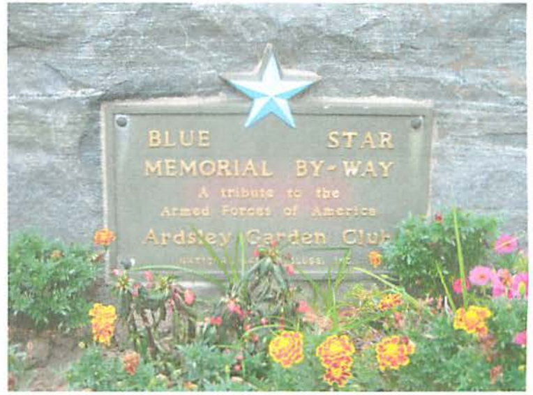
September 12, 2014 at 9:21:47 AM