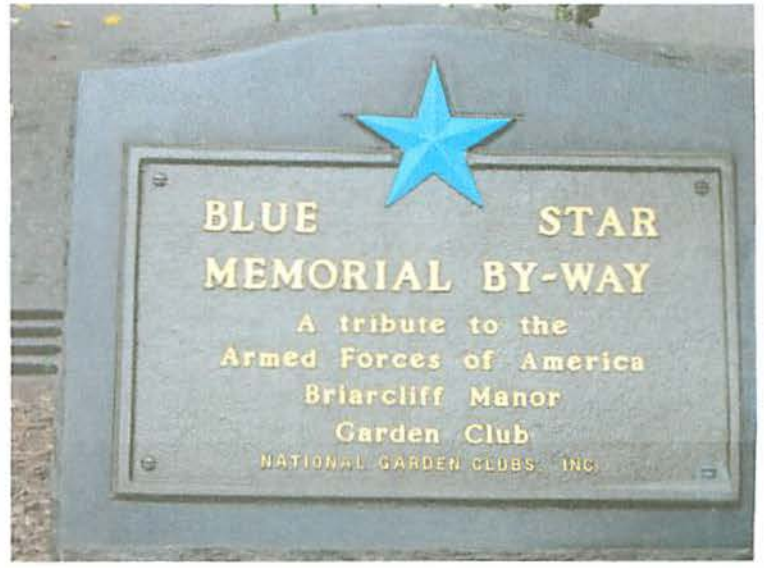
September 12, 2014 at 10:28:26 AM