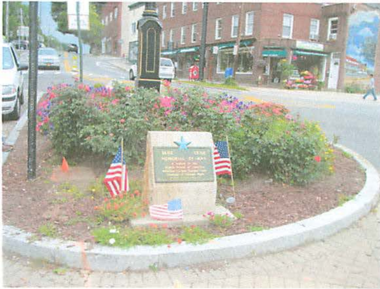
September 12, 2014 at 12:37:43 PM