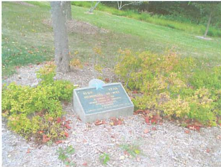
September 12, 2014 at 1:30:39 PM