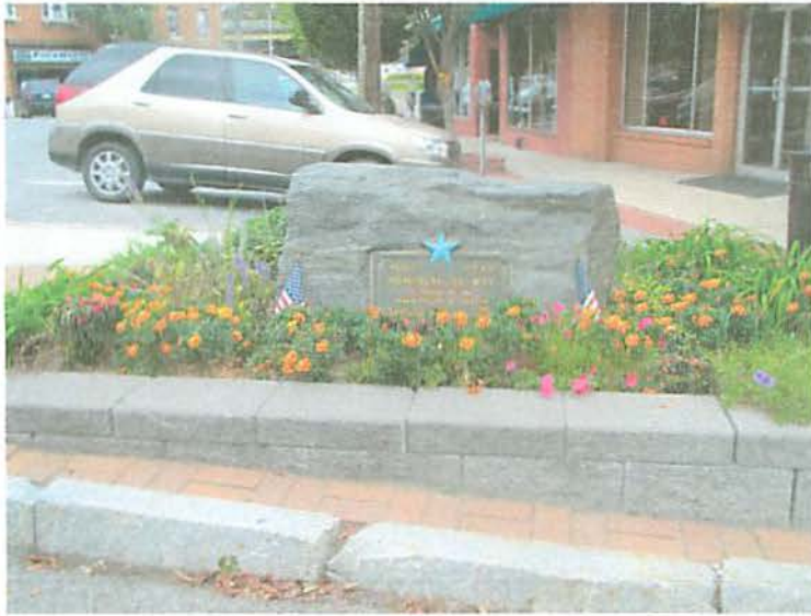
September 12, 2014 at 9:21:55 AM