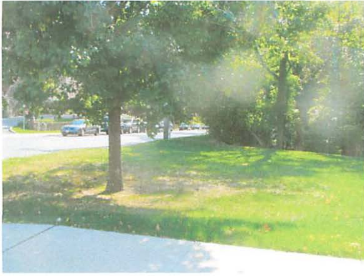
October 7, 2014 at 12:51:00 PM