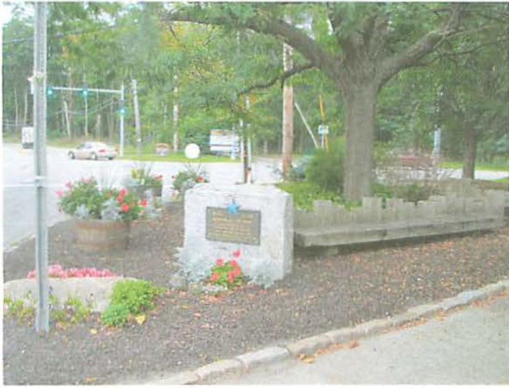
September 12, 2014 at 11:22:28 AM