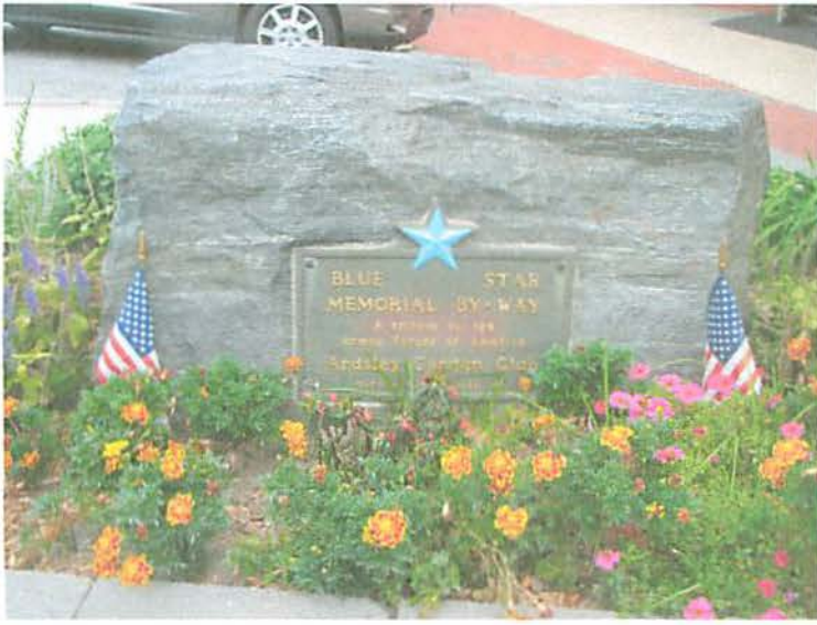
September 12, 2014 at 9:21:38 AM