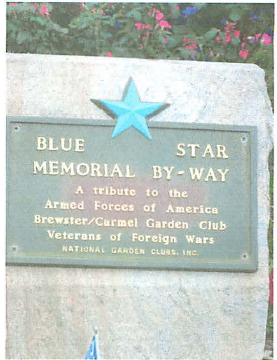
September 12, 2014 at 12:37:57 PM