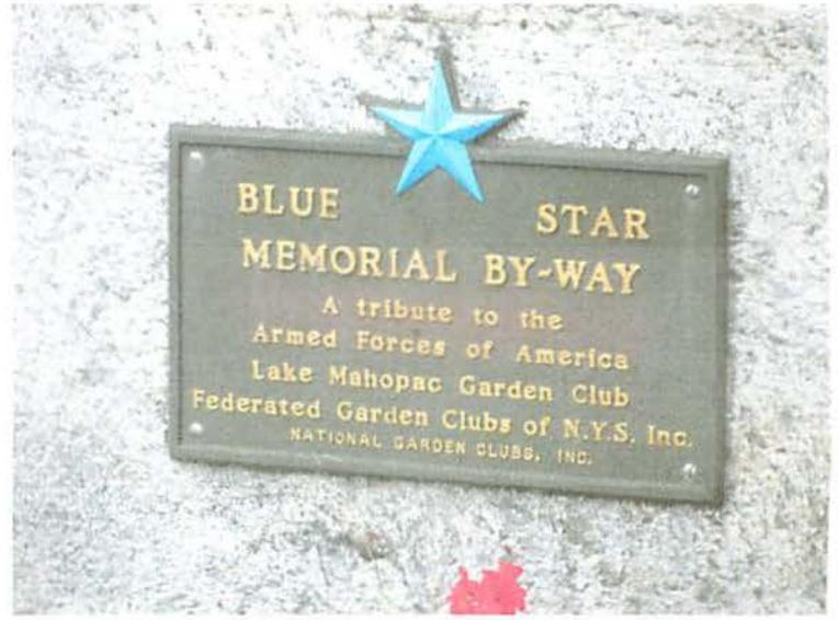
September 12, 2014 at 11:22:38 AM