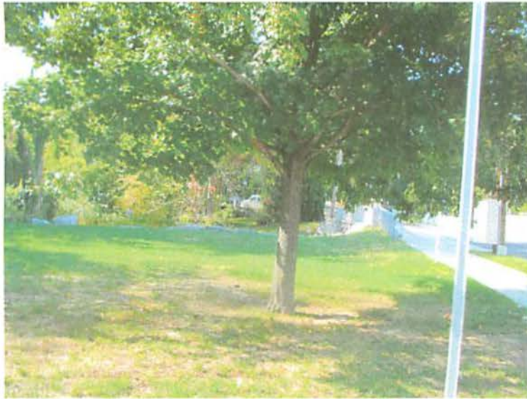
October 7, 2014 at 12:52:00 PM