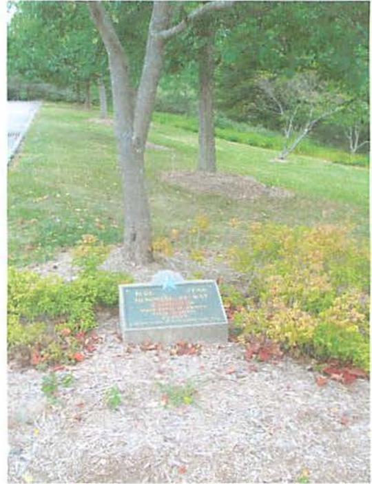
September 12, 2014 at 1:30:28 PM