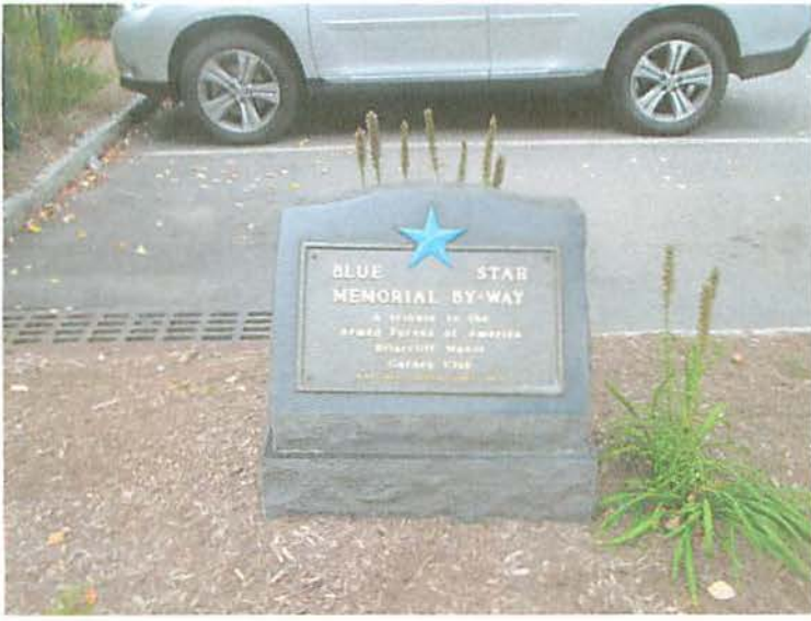
September 12, 2014 at 10:28:17 AM