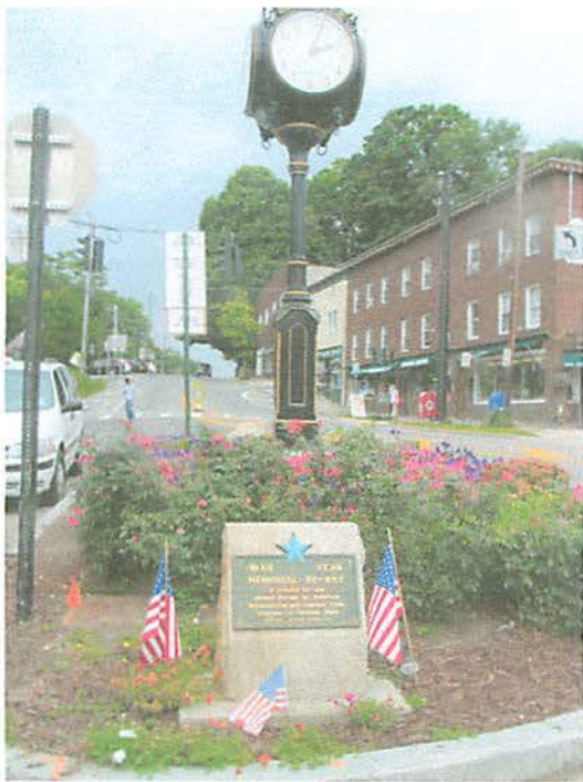
September 12, 2014 at 12:38:11 PM