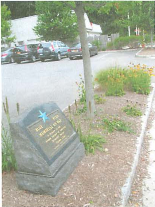
September 12, 2014 at 10:28:49 AM