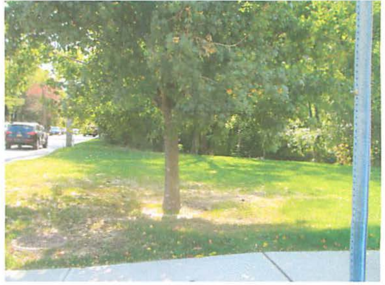
October 7, 2014 at 12:51:42 PM