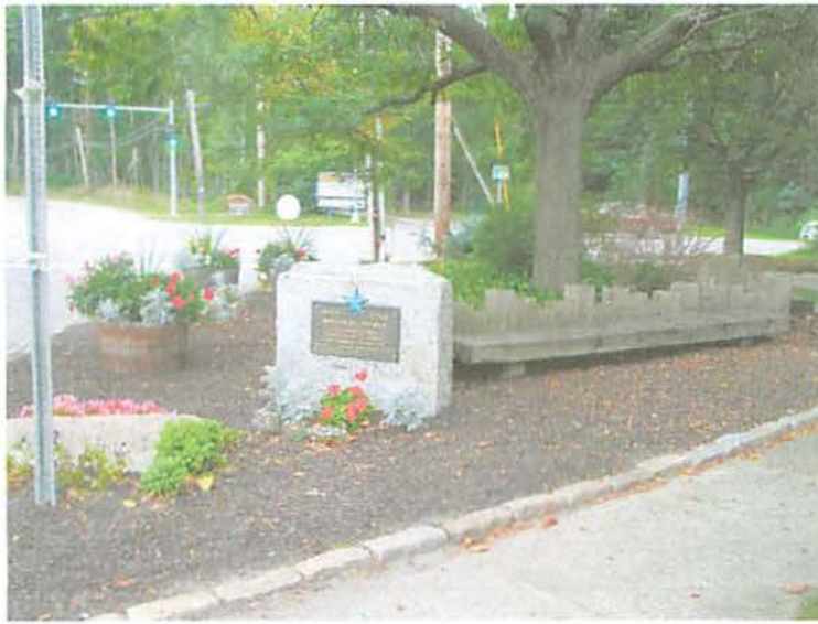
September 12, 2014 at 11:22:46 AM