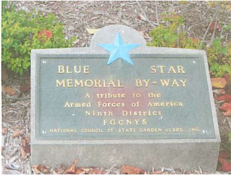
September 12, 2014 at 1:30:17 PM