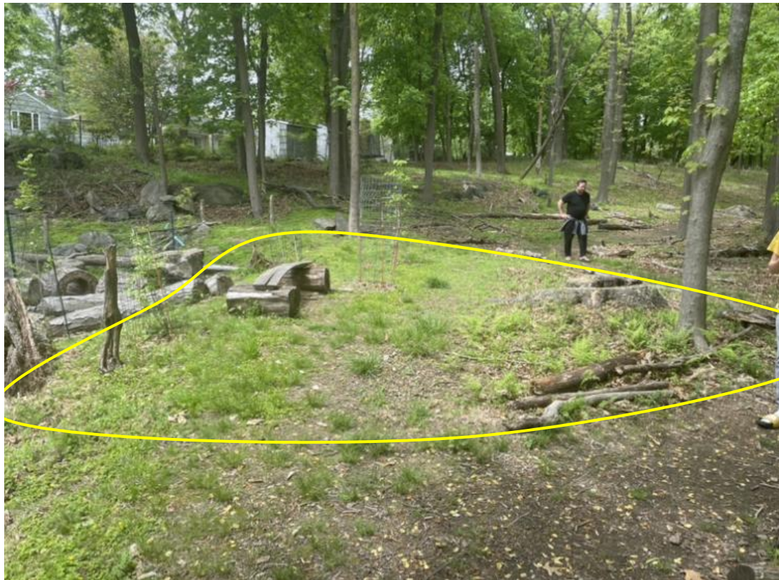
12' x 25' area framed with thick fallen branches