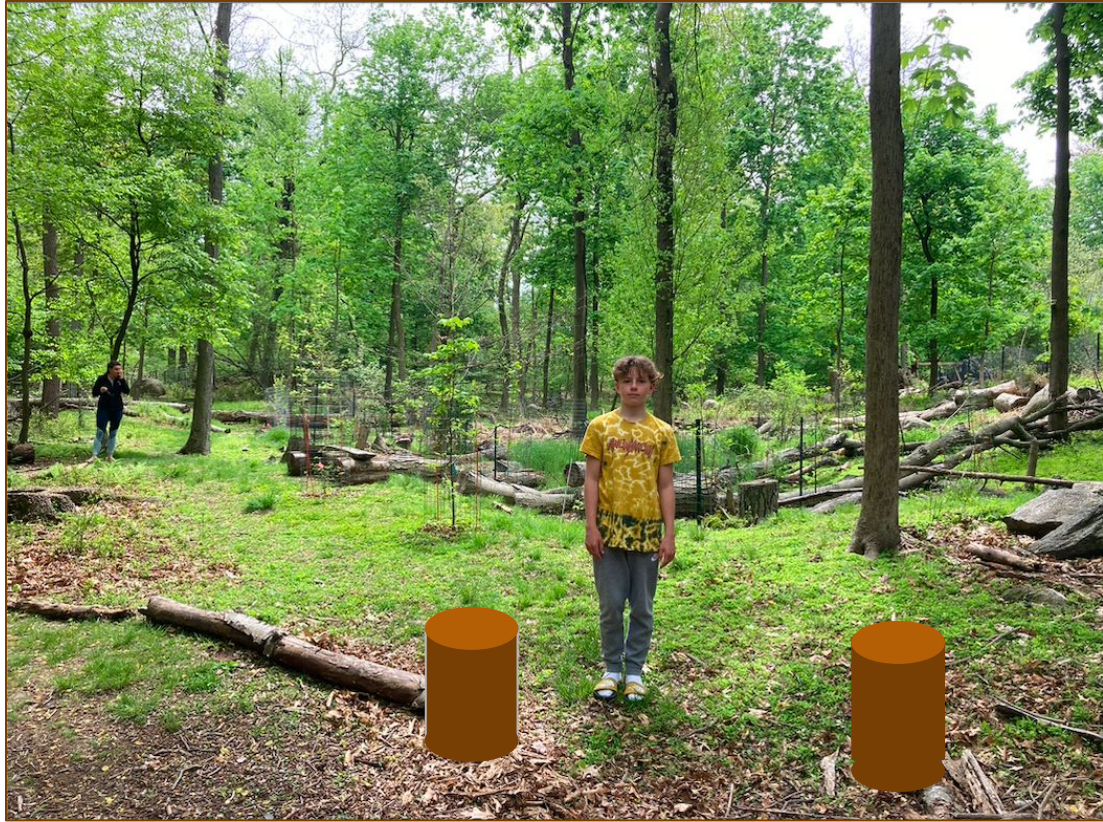
5' exit marked with reclaimed logs