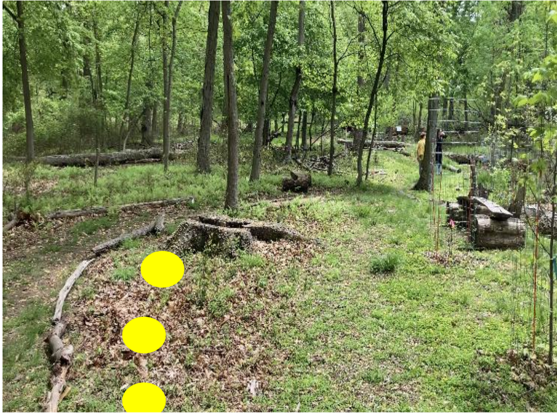
Location for 3 - 4 Adirondack-style wooden chairs