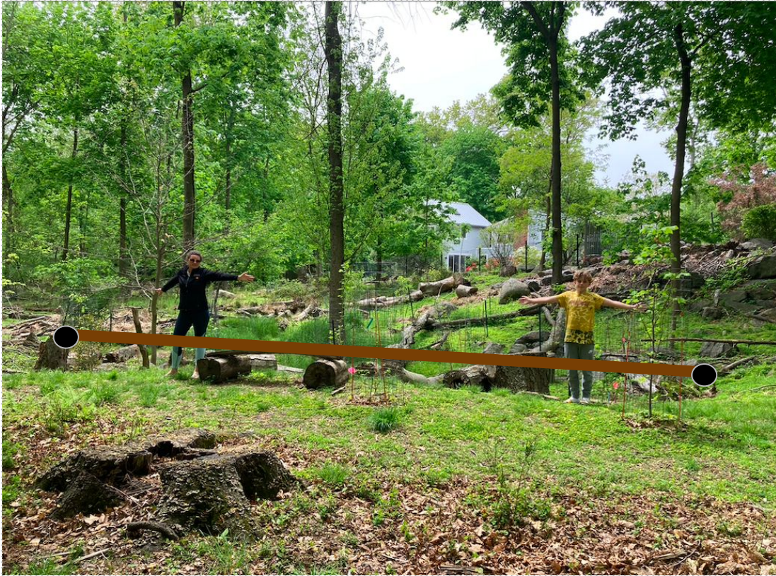
20' long split-rail fence along the steep slope