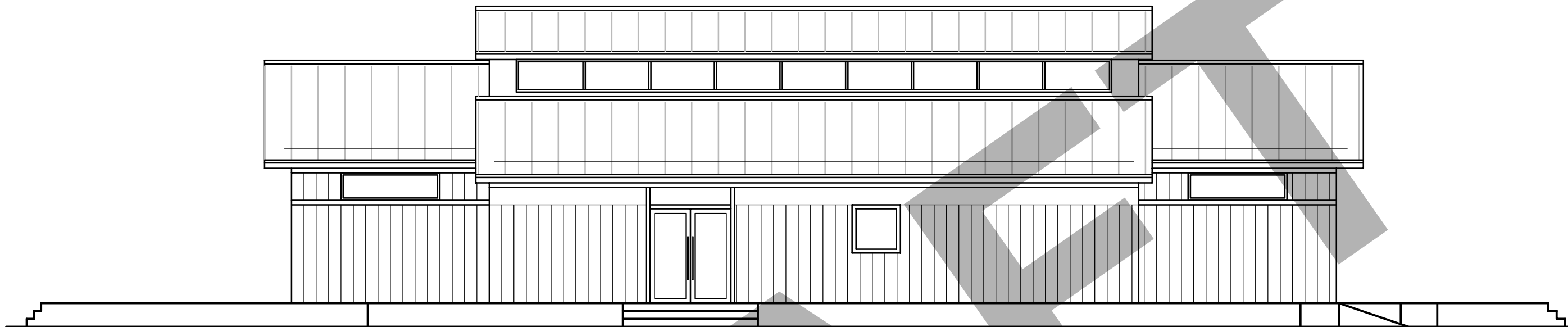
North Elevation (Front)